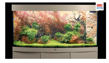
14 weeks later with CO<sub>2</sub>

9. The run-in period of the filter may last 6 - 8 weeks. You may increase the number of fish in steps during this time. Tip: JUWEL bioBoost is able to significantly cut the run-in period in your aquarium. Billions of filter bacteria will be immediately activated when they come into contact with the water and so enable you to take your aquarium into operation more quickly. bioBoost is available from your specialist dealer.